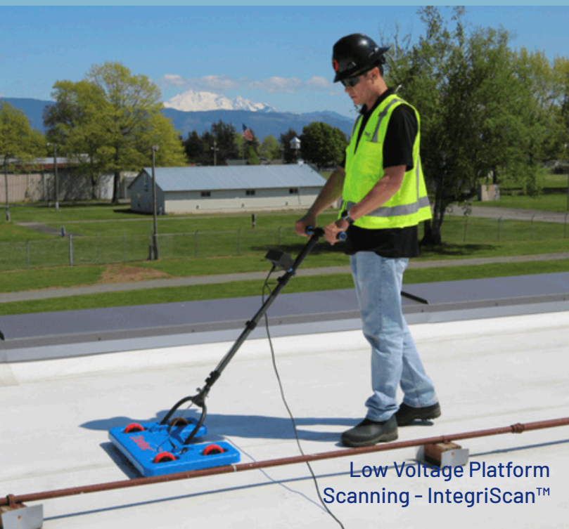
Low Voltage Platform Scanning - IntegriScan™

In the unlikely event of a dispute or roof damage, you'll have concrete evidence of the roof's condition upon completing your work, providing you and your clients invaluable peace of mind.