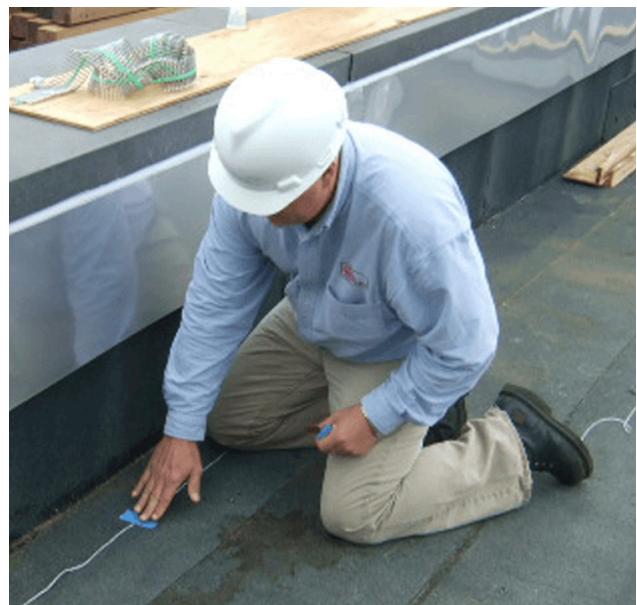
Technician installing trace wire for EFVM testing

Integrity testing can lead to stronger client relationships and a sterling reputation in the industry.