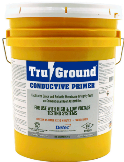
TruGround® Conductive Primer

Build better relationships by proactively identifying breaches, leaks, or moisture damage. Eliminate guesswork and pinpoint issues to foster greater cooperation between stakeholders.