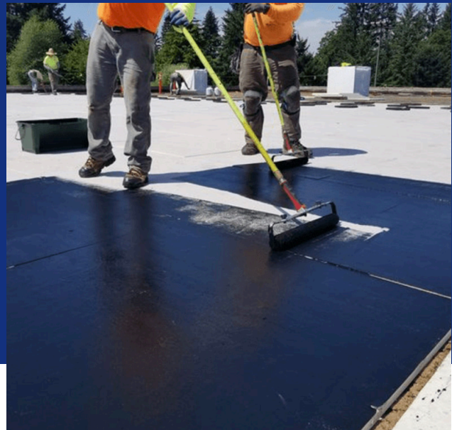
TruGround® Primer is simple to apply and dries in <30 minutes